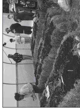
Planting in the greenhouse.

The STAR Club went outside the church and invested their time and energy into planting a community