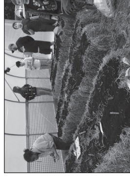
Planting in the greenhouse.

The STAR Club went outside the church and invested their time and energy into planting a community